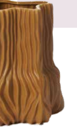
A striking yet natural organic form.